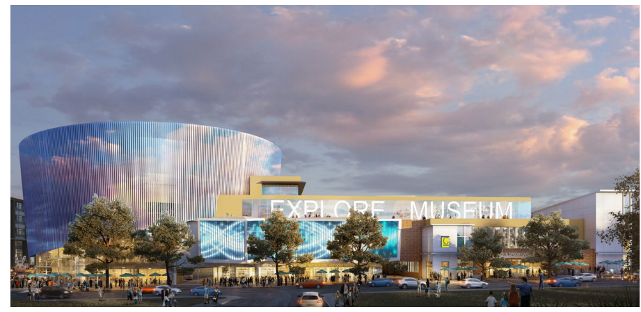
ACTIVATE SOUTH DAKOTA AVE RETAIL