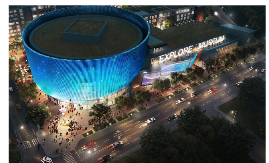
CONNECT PLAZA & METRO STATION